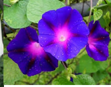
Star of Yelta